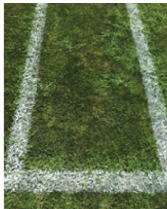
Turf Treated with Jonathan Green Organic Weed Preventer

* Jonathan Green Corn Gluten Weed Preventer 10-0-2 was applied at a rate of 1.5 lbs. per 1,000 sq. ft.