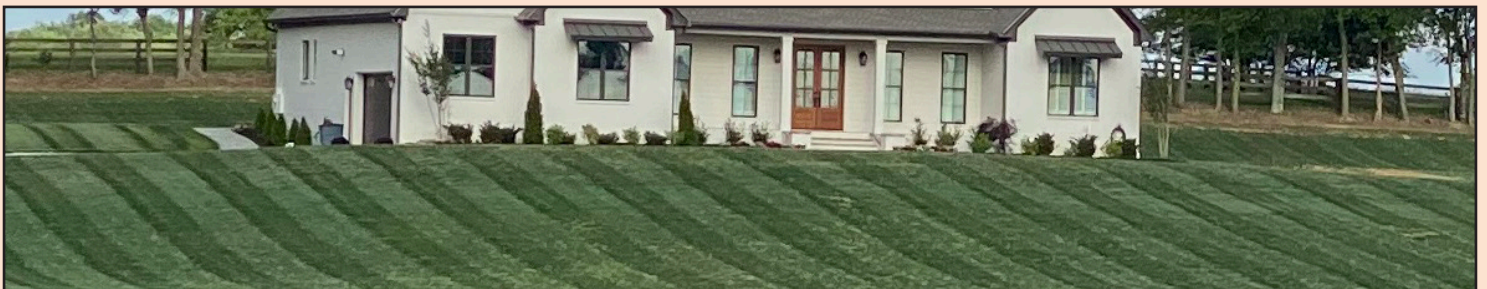
A Blue Gem Texas Bluegrass lawn