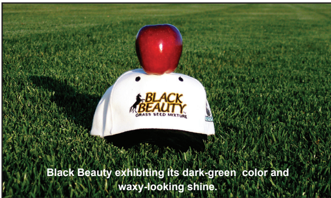
Black Beauty exhibiting its dark-green color and waxy-looking shine.

90% Tall Fescue 10% Texas Bluegrass 100%